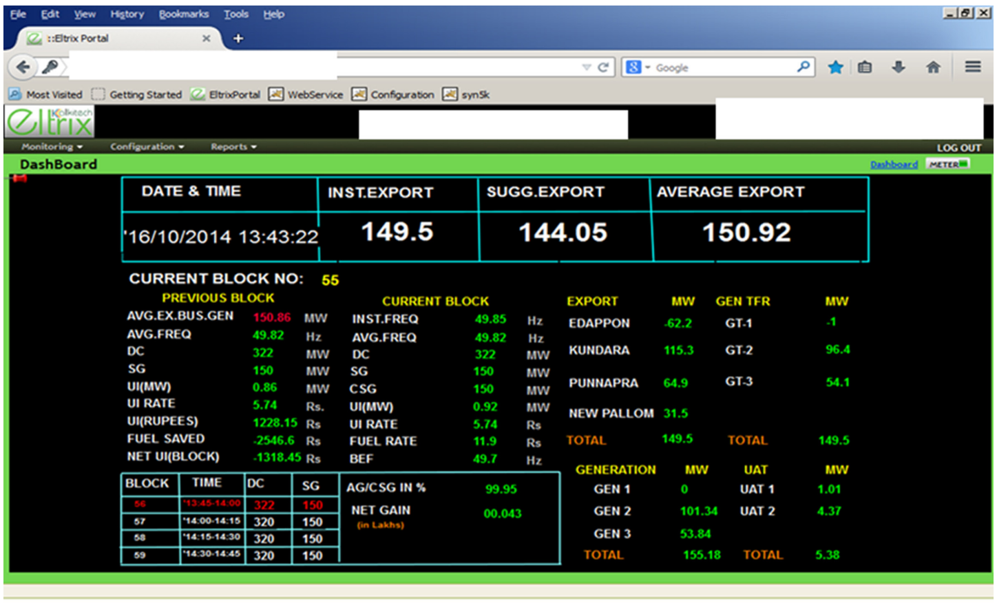
Figure 2- Dashboard